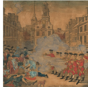
Activism & Protest