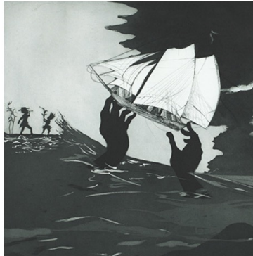
Immigration & Displacement